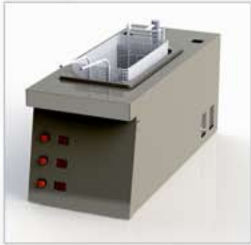
Table top fryer with automatic basket lifter Models: 5/8/11 Liters