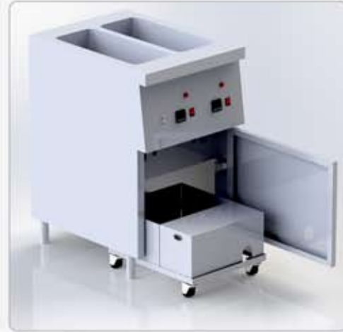
Double bowl fryer with built-in filtration Models: 15/20/25 Liters