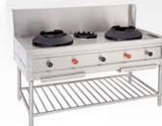
BURNER RANGES Indian/Chinese Single/Double/Triple